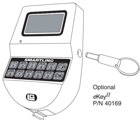
Optional eKey II P/N 40169