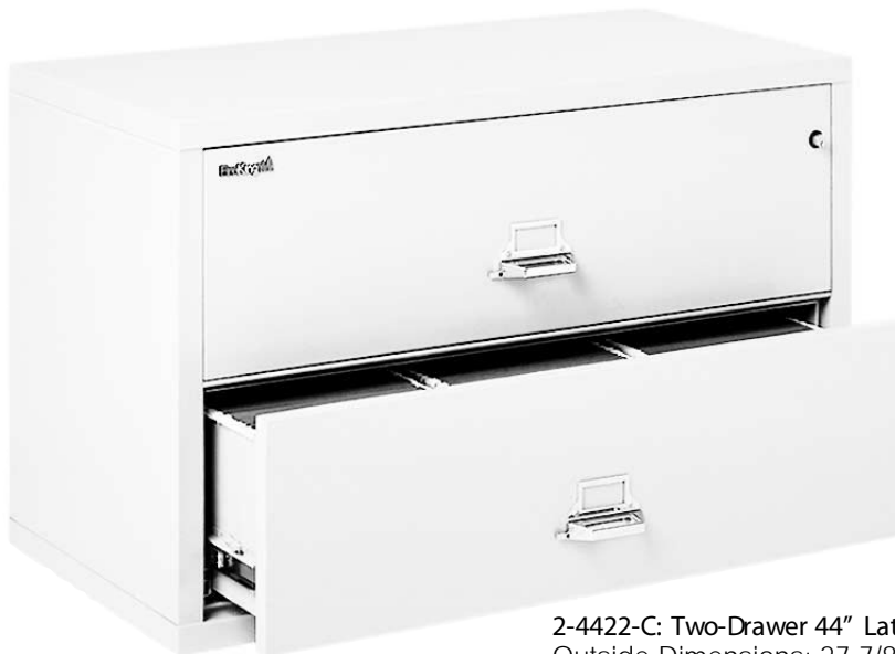
2-4422-C: Two-Drawer 44" Lateral File

Like all FireKing files, these carry FireKing's exclusive Lifetime Warranty on all parts. And our Free Replacement Guarantee: if your FireKing file ever has to protect your records in a fire and any damage occurs to its fire-protection abilities, we'll give you a new one free of charge.