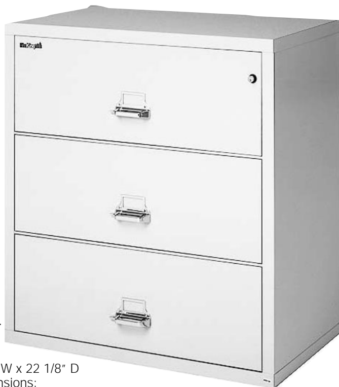
3-3122-C: Three-Drawer 31" Lateral File

Like all FireKing files, these carry FireKing's exclusive Lifetime Warranty on all parts. And our Free Replacement Guarantee: if your FireKing file ever has to protect your records in a fire and any damage occurs to its fire-protection abilities, we'll give you a new one free of charge.