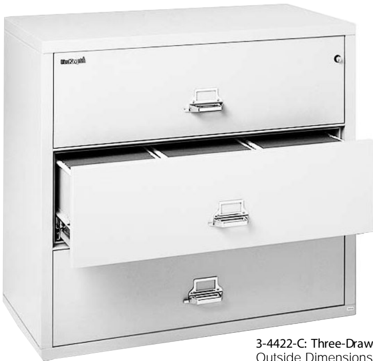
3-4422-C: Three-Drawer 44" Lateral File Outside Dimensions: 40 3/8" H x 44 27/64" W x 22 1/8" D Internal Drawer Dimensions: 10 3/8" H x 38 29/32" W x 15 1/4" D Approx. Shipping Weight: 869 lbs.

Like all FireKing files, these carry FireKing's exclusive Lifetime Warranty on all parts. And our Free Replacement Guarantee: if your FireKing file ever has to protect your records in a fire and any damage occurs to its fire-protection abilities, we'll give you a new one free of charge.