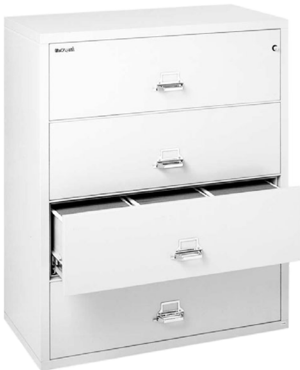
4-4422-C: Four-Drawer 44" Lateral File

Like all FireKing files, these carry FireKing's exclusive Lifetime Warranty on all parts. And our Free Replacement Guarantee: if your FireKing file ever has to protect your records in a fire and any damage occurs to its fire-protection abilities, we'll give you a new one free of charge.